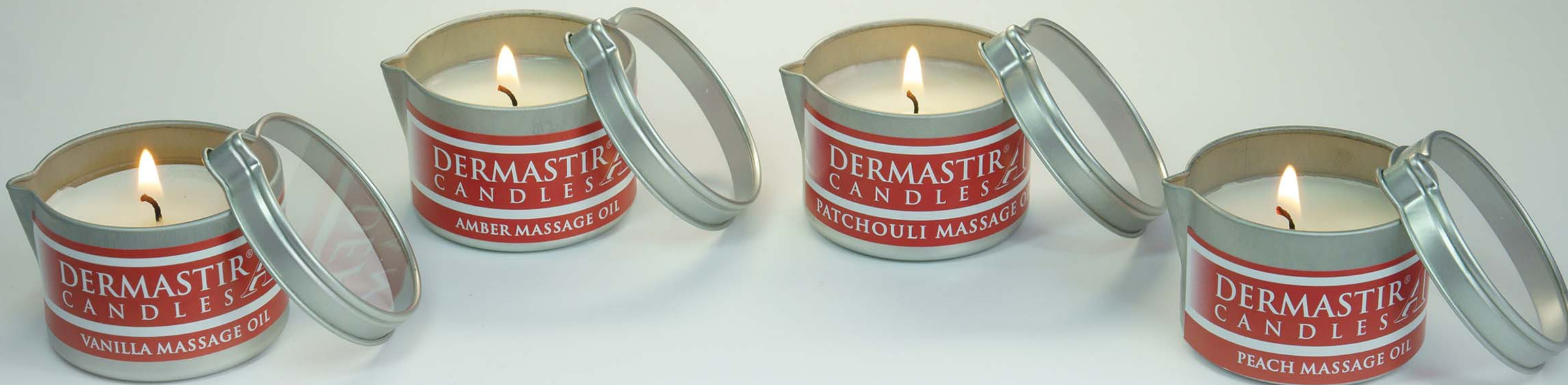
DERMASTIR MASSAGE CANDLE OIL VANILLA - 35g / 150g